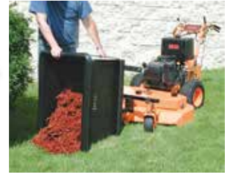
Optional 56 Gallon Tub Sold Separately Item # 6075.JRC