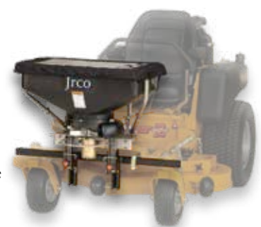
504U Receiver Mount Electric Broadcast Spreader