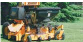
Model 504 Broadcast Spreader with push/pull-operated gate for electric walk-behind mowers.

The polyethylene hopper has a 2.2 cubic foot or 120-pound capacity. Electronic speed control accurately maintains spread pattern widths from 5-24 feet. Spreader is made of corrosion-resistant materials, stainless steel and engineered plastics. Sealed, quick-disconnect electrical cables are included for hook-up. Unit attaches to the JRCO mount bar with four clevis pins.