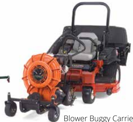
Blower Buggy Carrier