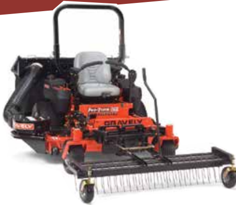
Tine Rake Dethatcher