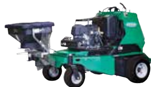
Model 504U Broadcast Spreader with receiver hitch mount for stand-on aerators.