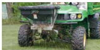
Model 504U Broadcast Spreader with receiver hitch mount for utility vehicles..