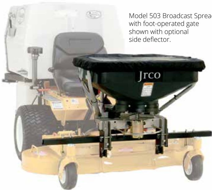
Model 503 Broadcast Spreader with foot-operated gate shown with optional side deflector.

The JRCO Broadcast Spreader (electric) is designed for the lawn care professional. Attach to your mower or utility vehicle for increased productivity with an accurate spread pattern at an increased, consistent ground speed. The heavy-duty broadcaster is ideal for spreading all types of granular and pelletized fertilizer, seed and ice-melting pellets.