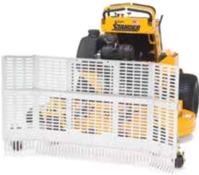
Leaf Blade Plow

INCREASE PRODUCTIVITY WITH JRCO (800) 966-8442 | jrcoinc.com